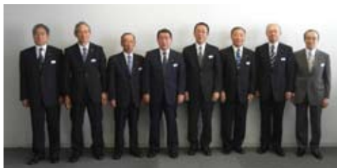
JR East's Eight Chroniclers of Safety

In FY2010, we organized a group of ex-employees of JR who possessed an abundance of knowledge and applied skills in railway safety to act as our “Chroniclers of Safety (narrators of oral history).” Currently, Chronicler of Safety Seminars are being conducted by a group of eight of these Chroniclers at Head Office and Branch Offices, in the hope that they will pass their accumulated experiences and skills down to future generations.