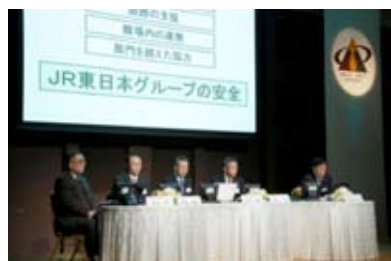
The 22nd Railway Safety Symposium

The theme for the Railway Safety Symposium was based on the concept that “each one should expand our capabilities to create safety through teamwork.” The symposium was attended by approximately 430 people, and served as the venue to introduce JR East's Group Safety Plan 2018. The company presented its road map for steadily executing its new safety plan and illustrated how the plan reflected its activities based on the 2013 Safety Vision.