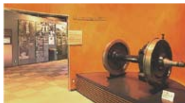
Accident History Exhibition Hall

In FY2015, we will newly construct a train accident preservation center for the preservation of actual trains damaged in accidents or disasters in order to comprehensively understand the events.