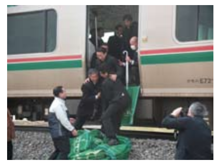
A drill to guide passengers in getting off trains