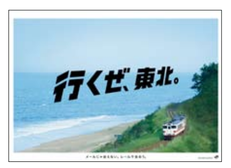
Restoration measures for disaster-damaged areas: Tourism campaigns

The areas affected by the Great East Japan Earthquake are still in the process of reconstruction, and their revitalization with the power of tourism is an important mission of JR East. In fiscal 2014, we conducted the Sendai - Miyagi Destination Campaign (DC) over the months April - June and the Akita DC over the months October - December. Throughout the same year, we promoted the GO! TOHOKU Campaign, which we launched in fiscal 2013 as a symbol of our efforts to assist recovery, and publicized travel to the Tohoku region on a continuous basis. In addition, we commenced sales of bus tour plans to support recovery and emphasized transportation of visitors to coastal communities such as Minamisanriku and Kesennuma, which incurred tremendous damage from the tsunami. We also marketed a tour plan to support the affected areas that was linked with an aid project of the Tokyo Metropolitan Government under the banner "GO! FUKUSHIMA! Nice Price in Summer! Fukushima" and a bus tour for support of recovery in Iwate Prefecture, with a guided tour of disaster sites. The latter included financial aid for the affected areas. In these and other ways, we strove to assist recovery and revitalize communities in these areas.