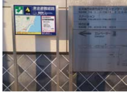
Evacuation route map