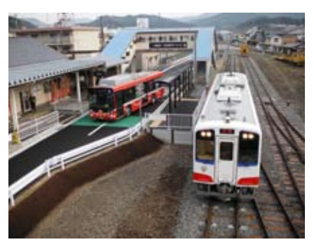
Ofunato line BRT. Sakari Station

The suspension of train operations along line sections badly damaged by the earthquake and tsunami has now been reduced from the initial 400 km to approximately 240 km as of July 1, 2014. JR East will, of course, continue to cooperate with both national and local government authorities to bring about restoration of damaged railway lines, as well as in plans to rebuild the area as a whole and further develop towns, while at the same time ensuring the paramount safety of customers.