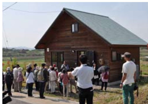
Migration trial tour