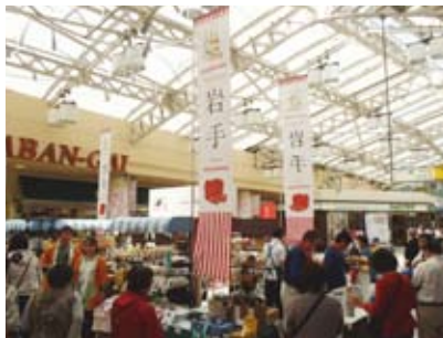
Rediscover Local Areas Project "Farm fresh market"

We are working to revitalize the local food industry by holding farm fresh markets and through encouraging the expansion of agriculture, forestry and fishery to include food processing, logistics and marketing.