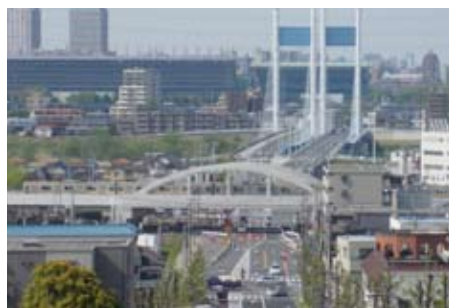
Railway overpass construction project near Inagi-Naganuma Station on the Nambu Line

The project near Inagi-Naganuma Station on the Nambu Line, in which all level crossings will be removed by placing the railway on a viaduct by the end of this fiscal year, will unify towns and eliminate congestion by reducing the number of level crossings.