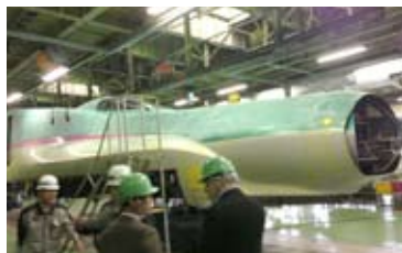
Inspection of Shinkansen railcar maintenance (Shinkansen General Rolling Stock Center)

JR East also receives inspection visits by overseas visitors involved in railway operations. During fiscal 2013, for example, we had 620 visitors from 46 countries. These visitors have included government officials from each country, people engaged in railway operation and researchers from universities and research institutes. These visits help to promote mutual understanding.