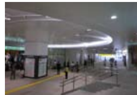
Free passage at Oyama Station on the Tohoku Line