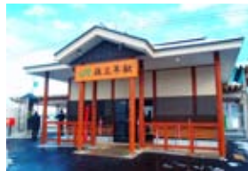
Gosannen Station on the Ou Line

We are also cooperating with local governments in the creation of new stations, in line with their city planning, and the improvement of existing station buildings with free passages and other facilities, based on requests from local authorities. In the fiscal year ended March 2012 we opened a new station, Yoshikawa-Minami, on the Musashino Line, and we improved Gosannen Station on the Ou Line by building a community space (local government facility) in the fiscal year ended in 2013. Since our establishment in 1987 we have introduced local government facilities into a total of 84 stations (as of March 31, 2013). In the fiscal year ended March 2013, Oyama Station on the Tohoku Line and Iwama Station on the Joban Line also were improved by construction of free passages.