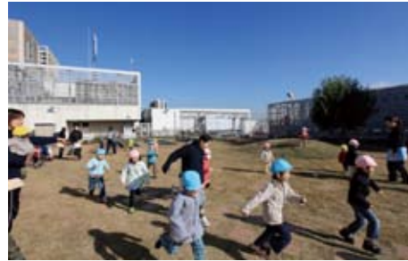
Children playing on station rooftop