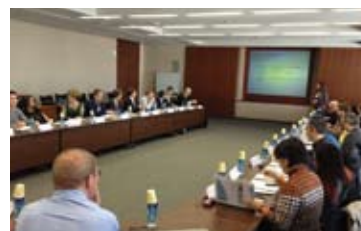
UITP Training Programme (Tokyo, 2013)