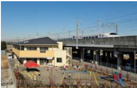
Shinkansen train and nursery school near station

JR East has opened childcare support facilities such as "nursery schools near stations" located in easily accessible areas that are usually within a five-minute walk from the station, to support the combination of childcare and commuting to work. A total of 71 childcare support facilities were opened from 1996 through April 2013, and JR East is continuing to increase the number of these facilities. These nursery schools near stations have the advantage that parents can drop and pick up their children on the way to and from work. As evidenced by the scene that children come to the nursery with fathers, our childcare support encourages fathers' participation in childcare as well.