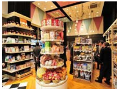
NOMONO, the local produce shop