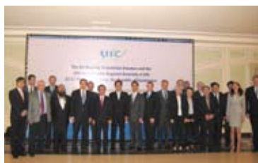
UIC Asia Pacific Regional Assembly (Astana, Kazakhstan, 2013)

JR East executives have also served as chairman of the Asia-Pacific regional assembly (APRA) since January 2013 and Vice President and Director of the UITP Policy Board since May 2013. Through the activities in such international organizations, we will contribute to the development of railways throughout the world.