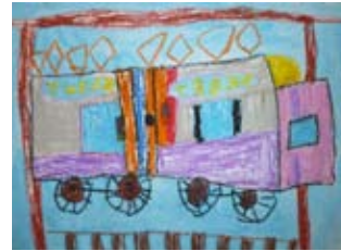
Third Children's Train Craftwork Exhibition