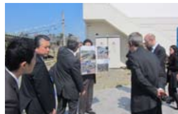
Visiting Nobiru Station, which was affected by the Great East Japan Earthquake