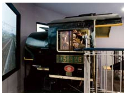
The Railway Museum