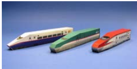
Image of completed paper-crafting works

Various events that parents and children can enjoy together, such as a Paper-crafting Class showing how to make a 3-D Shinkansen mockup from special paper, take place in a variety of locations.