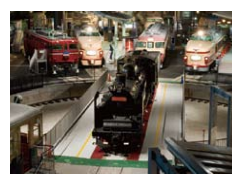
The Railway Museum opened on October 14, 2007. (Railway Day) (Omiya Ward, Saitama City)