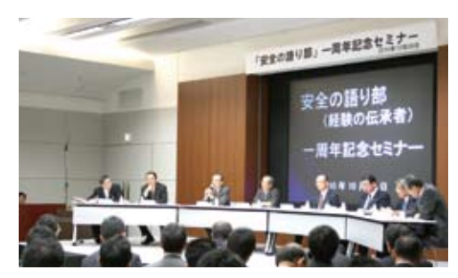
The Chronicler of Safety Seminar: Commemorating the 1st anniversary of the organization

In FY2010, we organized a group of ex-employees of JR who possessed an abundance of knowledge and applied skills in railway safety to act as our "Chroniclers of Safety (narrators of oral history)." Currently, Chronicler of Safety Seminars are being conducted by a group of eight of these Chroniclers at Head Office and Branch Offices, in the hope that they will pass their accumulated experiences and skills down to future generations.