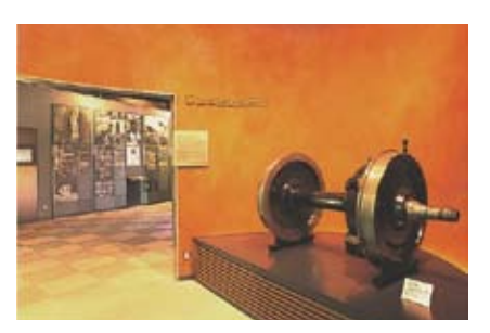
Accident History Exhibition Hall