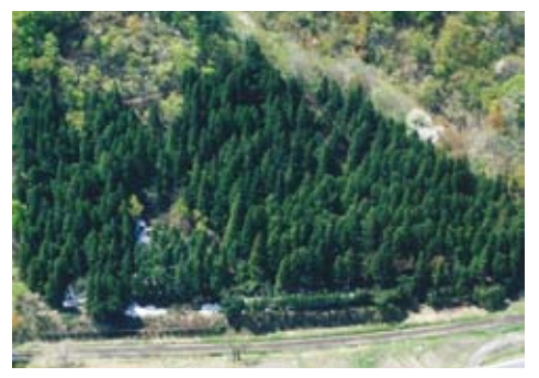
Tenoko No. 6 railway forest on the Yonesaka Line (forest to protect against snow slides)