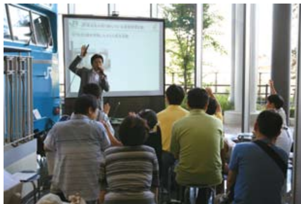
Seminar on environmentally friendly railways at the Railway Museum

In July 2011, the Railway Museum hosted a seminar for elementary school students on environmentally friendly railways. During the daylong course, the participants were given the opportunity to gain a broad understanding of global environmental concerns through a study of JR East's environmental measures and learned the importance of recycling through experiencing the separation of garbage generated both at stations and on trains.