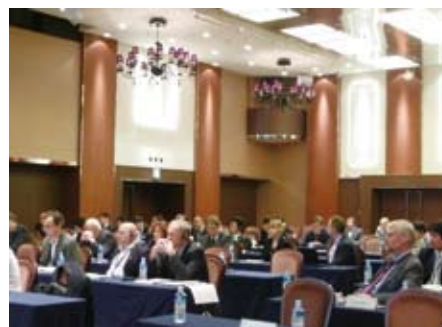
International Symposium on Level Crossings (Tokyo, 2010)