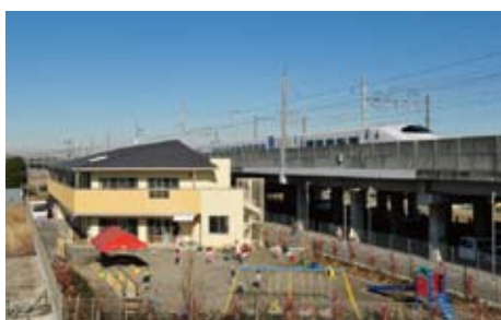
Shinkansen train and nursery school near station

As part of our urban development initiatives in cooperation with local communities, JR East is supporting the opening of childcare facilities such as nursery schools in locations within five minutes of stations, thereby enabling parents to balance childcare responsibilities and employment. The total number of childcare support facilities opened since 1996 reached 54 in April 2011 and further expansion is being targeted. Nursery schools adjacent to stations have the advantage of enabling parents to drop off and pick up their children on their way to or from work. We have also noted an increase in the number of children being dropped off and picked up by their fathers, which demonstrates that our efforts in this field are leading to an increased level of male participation in childcare. We will continue to accommodate a variety of childcare-related needs and broaden the framework of our childcare initiatives to include not only nursery schools but also kids' station and station after school centers which take advantage of their location near stations, as well as nursery services such as our parent-child community cafés which can be used by all people involved in child-rearing regardless of whether they are working or not. Thus JR East will actively contribute to local neighborhoods and enhance the values of the communities located adjacent to our railway lines.