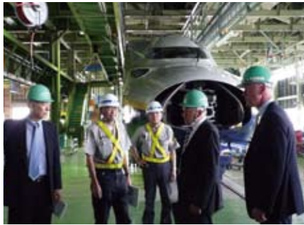
Inspection of Shinkansen railcar maintenance (Shinkansen General Rolling Stock Center)

JR East also welcomes inspection tours of overseas visitors involved in the running of railways, and in the fiscal year ended March 2011, for example, we hosted 746 visitors from 60 countries. During these tours, we organized on-site visits that covered a wide variety of subjects including an introduction to the methods necessary for the privatization of a national railway company, explanations and descriptions of such cutting-edge technologies as Shinkansen trains and the Suica IC card, steps to be taken for the conservation of the global environment, and JR East's lifestyle services businesses.