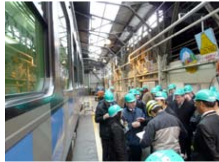
Inspection of hybrid railcar Koumi (Koumi Line Sales Office)