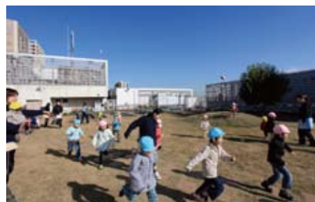
Children playing in station rooftop garden