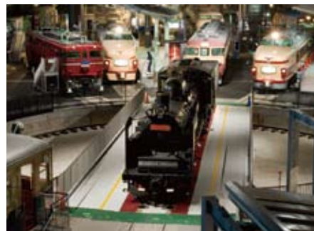
The Railway Museum opened on October 14, 2007. (Railway Day) (Omiya-ku, Saitama-shi)