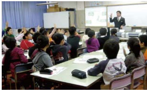
Delivering an environmental education program at an elementary school in Tokyo

In the fiscal year ending March 2010, to contribute to the development of a sustainable society, JR East initiated environmental education programs for the children to lead the next generation so that they are able to understand environmental issues and their relationships with the society. The program aims to educate children on "Information and the Environment," a program which we will continue to develop further.