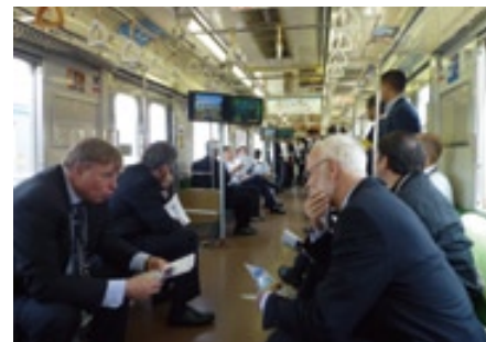
Inspection of ATACS on the Senseki Line