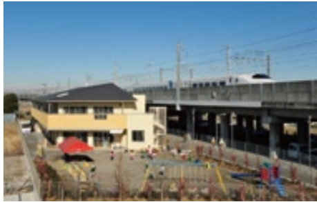
Shinkansen train and nursery school near station

JR East is continuing to open more childcare facilities such as nursery schools in locations within five minutes of stations, and thereby supporting those who have to balance child raising and work. The total number of childcare support facilities opened since 1996 had reached 34 in April 2010 and further expansion is being targeted. Nursery schools adjacent to stations have the advantage of enabling parents to drop off and pick up their children on their way to or from work. We have also noted an increase in the number of children being dropped off and picked up by their fathers, which demonstrates that our efforts in this field are leading to an increased level of male participation in childcare. We plan to continue to expand our childcare services that meet a broad variety of needs and thus actively contribute to local communities, thereby enhancing the values of communities located along our railway lines.