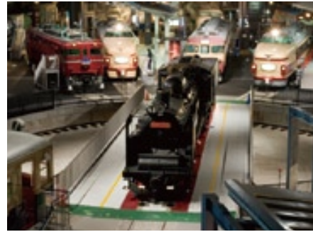
The Railway Museum opened on October 14, 2007. (Railway Day) (Omiya-ku, Saitama-shi)