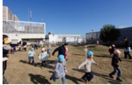
Children playing in station rooftop garden