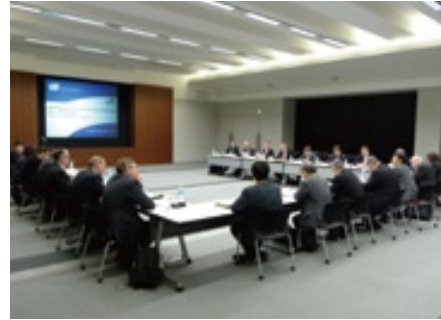
UITP Regional and Suburban Railways Committee (Tokyo, 2010)