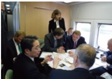
Inspection of the East-i multi-purpose (Shinkansen track and electrical facilities inspection train)

JR East shares its technologies and the expertise it has nurtured with people and organizations throughout the world. In the fiscal year ended March 2010, for example, 478 people from 47 countries visited us. Information provision and on-site inspections and seminars covering a wide variety of subjects were provided, including an introduction of the issues and methods concerning privatization of a national railway, such cutting-edge technologies and know-how as Shinkansen trains and the Suica IC fare-card, conservation of the global environment, and our lifestyle services businesses. In addition, based on requests from such organizations as the Ministry of Land, Infrastructure and Transport, we are actively involved in international cooperation through the dispatch of our railway experts to Asian and other neighboring countries to provide on-site advice.