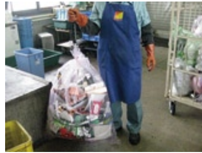
After checking for holes on collected used trash bags, the bags are washed, dried and reused