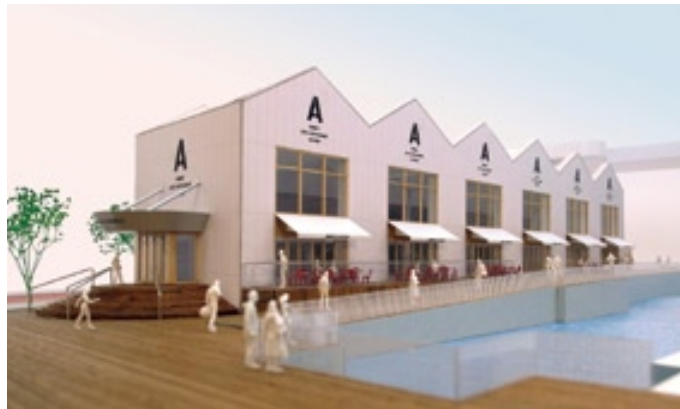
Factory & Market (provisional name) in the Aomori waterfront area

In order to continue these initiatives with further strength under the Create Together strategy, JR East will promote local revitalization as a new role to be taken on by all our employees in cooperation with local powers including regional governments, organizations, producers, schools, and companies. As part of the Rediscover Local Areas Project, we will create the systems and frameworks necessary for the promotion of these approaches by the end of the fiscal year ending March 2011 and, thereby, accelerate JR East Group's ability to meet new challenges.