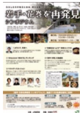
Iwate-Hanamaki Rediscovery Symposium