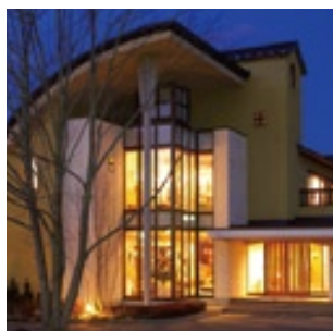
Folkloro Iwate Towa

In regard to the utilization of local products and the expansion of sales channels, our initiatives are continuing apace with tie-ups with Group companies. Our collaboration with local governments, organizations, and producers has been strengthened and efforts are constantly being made to contribute to the revitalization of local resources and industries through the exploitation of local products and traditional crafts, the development of processed agricultural products, and the holding of farm-fresh markets.