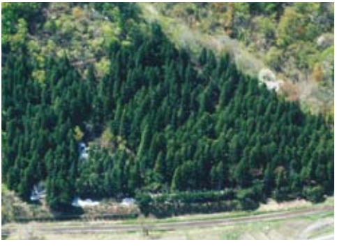
Tenoko No.6 railway forest on the Yonesaka Line (forest to protect against snowslides)