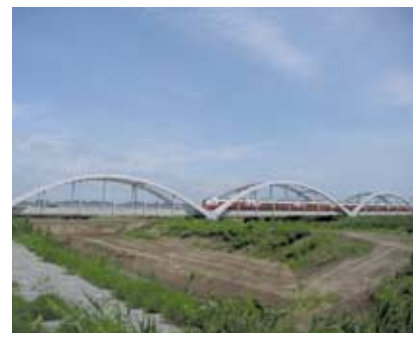
The bridge over River Tenma between Kamikita-cho and Ottomo on Tohoku Main Line, where serial concrete arch design is adopted in an effort to create harmony with the beautiful scenery of the mountains of Aomori.

Large structures such as bridges, stations, and station buildings affect the landscape and cityscape of surrounding areas. In order to harmonize structures with the surrounding landscape and cityscape, JR East has set up Design Committees in our construction offices responsible for planning and designing of these structures. We also encourage our employees to pay more attention to the surrounding areas in the design stage by giving awards to those who designed scenically attractive structures.