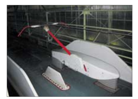
Test train "FASTECH 360" uses a low-noise singlearm pantograph.

As part of our research and development efforts, we have conducted test runs of a prototype high-speed Shinkansen train, FASTECH 360. We are striving to establish a high-speed, eco-friendly Shinkansen technology that could reduce noise and micropressure wave in tunnels. *2