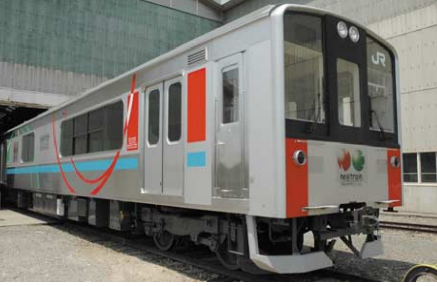
Start of fuel cell hybrid railcar running tests