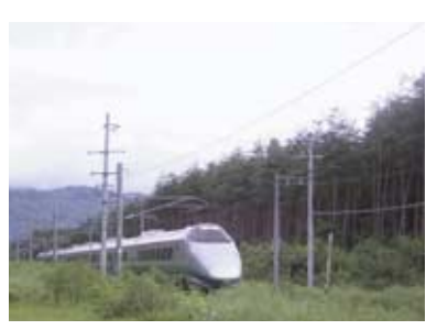
Railway trees can also play a role in environment preservation