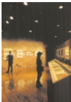
Tokyo Station Gallery

Examples of exhibitions being held in fiscal 2002