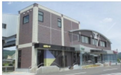
Ugo Iwatani Station (Uetsu Line) with a community hall

JR East sees a station as not only an “Arrival and departure point for travel,” but also as a “Base for the transmission of information and culture” where a broad range of people are able to gather. Accordingly, in conjunction with construction plans advanced by local governments for areas close to stations, we are in the process of building improved bridge-structure stations (stations built on a bridge over the railway line) in these areas, and establishing a station plaza system in a number of venues. These projects play a significant role in the revitalization of local communities, and can also contribute to the creation of communication spaces in stations in the form of such public facilities as public halls or libraries.