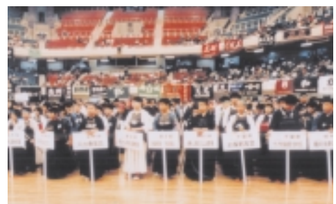
JR East Junior Kendo (Japanese fencing) Competition

JR East has been sponsoring the “JR East Junior Kendo (Japanese fencing) Competition” intended for young fencers living in JR East areas. The event allows the fencers to demonstrate in performance what they have achieved in their routine training and provides an occasion for friendly interaction with other fencers. It also supports the general principle of maintaining wholesome health and environment through participation in sport. The Kendo Competition held in August 2002 marked the 13th time this event had been held. In addition to kendo, we support ski competitions held at Gala Yuzawa and Tazawako ski resorts, the Kanto university soccer league, and other sporting groups and events.