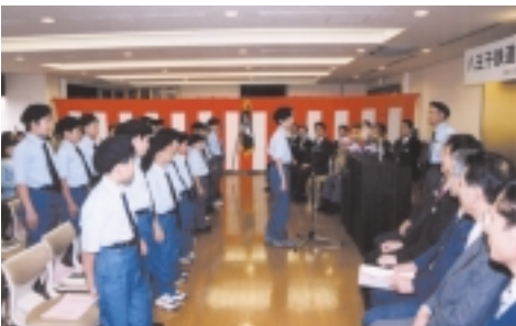
"Railway Children Association" foundation ceremony at JR East branch office

By setting up the secretariats supporting "Railway Children Association" at branch offices, and other offices, JR East assists in planning activities, preparing procedures for activities, passing information to members and leading/guiding groups of members. Moreover, by providing places for activities, including stations, trains, and driving simulators, JR East is extensively and positively supporting children's activities.