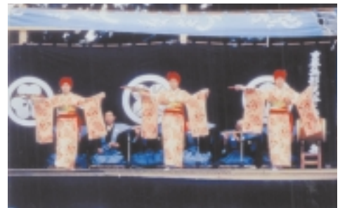
Support for local cultural projects "Ayako Mai (dance) in Kashiwazaki City, Niigata Pref."

In order to revive local culture, we strive to support traditional cultures, which still persist in some parts of eastern Japan, in order to preserve them for future generations. We have asked our JR East branch offices to suggest projects, and have been granting subsidies since 1993. (In fiscal 2001, 12 projects were subsidized at a total cost of 51 million yen.)