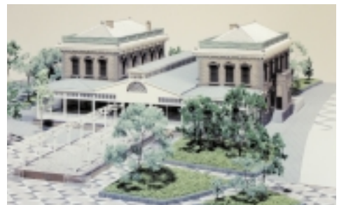
Old Shimbashi Station Building seen from the platform (1/100 scale model)

Furthermore, there is an ingenious plan that will allow visitors to view the original foundation stones of the former station, and learn about the history of the railway and Shiodome through the exhibition of windows and railway relics discovered at the Shiodome site. All this will be available through the "Exhibition Room of