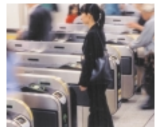
IC card wicket gate system

In November 2001, the debut of the “IC card wicket gate system” allows passengers to pass through the gate by lightly touching the automated wicket gate machines using the “Suica commutation ticket” or the “Suica IO card.” This eliminates the inconvenience of having to visit a ticket vending machine, prepare small change or remove the card from commutation ticket holders. From April 2002 this system came into common use at Tokyo Monorail Co., Ltd. At present, the “Suica” system can be used at 461 JR East stations throughout the Tokyo metropolitan area and nine Tokyo Monorail Co., Ltd. stations. The number of passengers taking advantage of this system exceeded 4 million in May 2002.