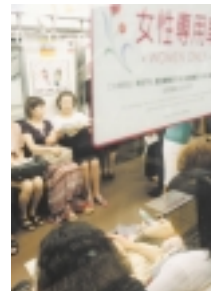
Railcars reserved for use by female passengers only

To allow all passengers to travel in greater safety and comfort, we have introduced women’s only carriages on the Saikyo Line.