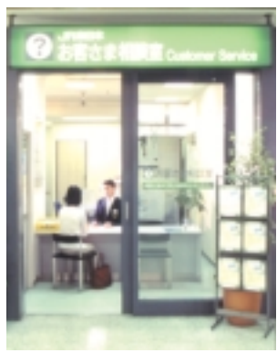
Customer Help Desk