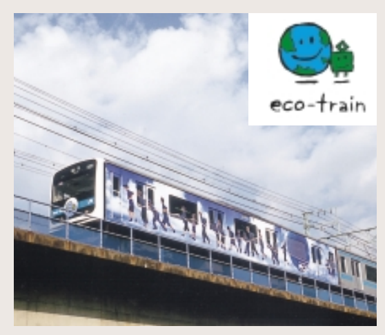
Eco-train, run between December 1999 and January 2000