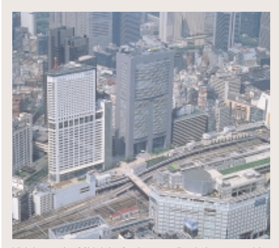
Vicinity south of Shinjuku Station, standing in harmony with its environment (center: the JR head office building)