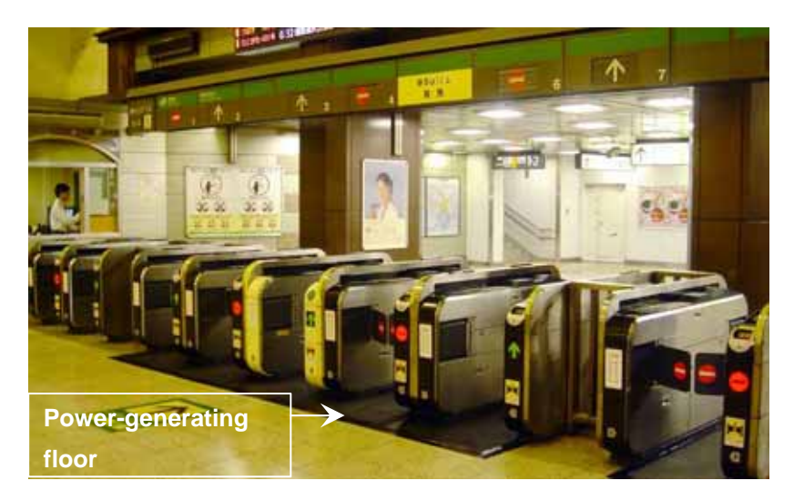
Photo: Last year's experimental Power-generating floor at Tokyo Station's Marunouchi North Exit

From the 3<sup>rd</sup> week of the experimental period (a total of 800,000 people passing), production of electricity decreased due to a degradation in durability.