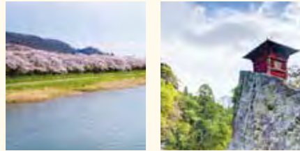
③ Kitakami-Tenshochi ④ Yamadera