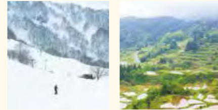
③ Echigo-Yuzawa ④ Tokamachi