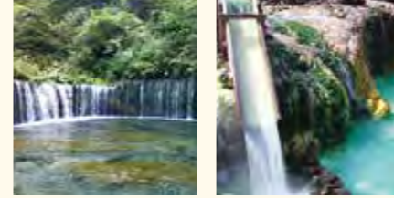
⑤ Karuizawa ⑥ Kusatsu