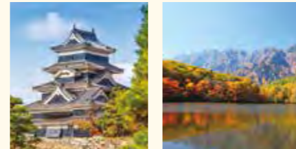
① Matsumoto-jo ② Kamikochi

If you want to make the most of your trip in Eastern Japan, we recommend a visit to the Nagano and Niigata areas. Both are relatively close to Tokyo and offer a wide variety of sightseeing spots, including leisure facilities such as hot springs and ski resorts – all surrounded by stunning views.