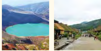
⑤ Zao ⑥ Uchijuku