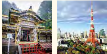
⑦ Nikko ⑧ Tokyo