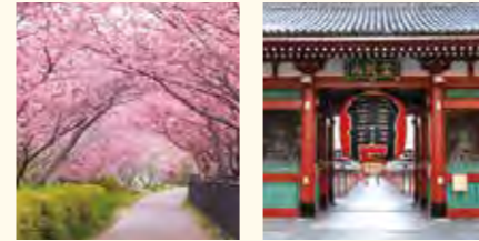
⑦ Izu ⑧ Tokyo (Senso-ji)